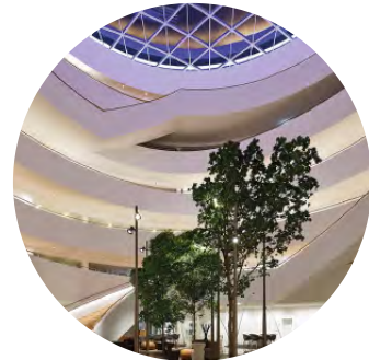
Denmark 2014 Novo Nordisk new headquarters