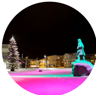
Iceland 2014 Akratorg