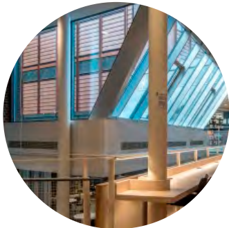
Sweden 2015 Lux Campus by Lund University