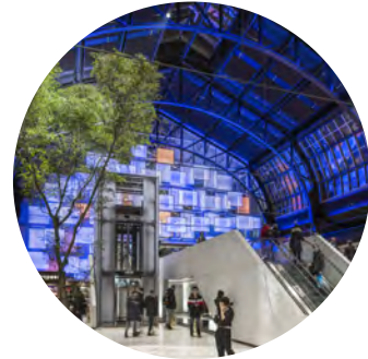
Norway 2015 Östbanehallen