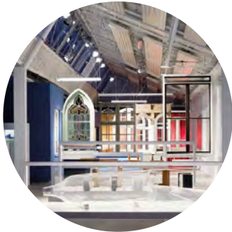
Denmark 2015 Villum Window collection