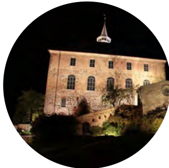
Norway 2014 Akershusfestning