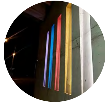
Iceland 2015 Bridge over Fífuhvamsvegur